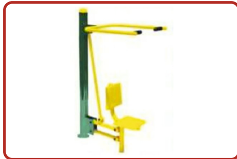
Single Seated Puller