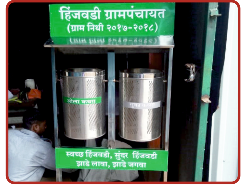
SS Swing Dustbin