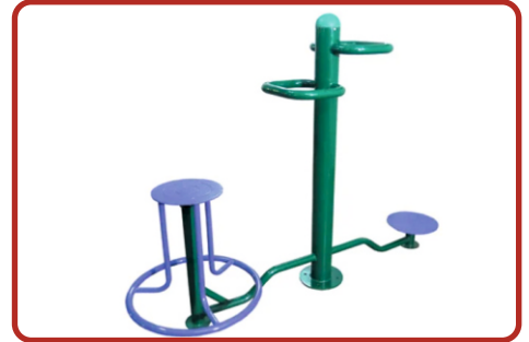
Twister 2 in 1