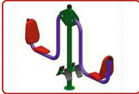
Leg Press Double