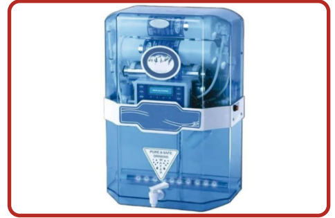
Domestic Water Purifier