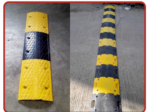
Plastic / Rubber Speed Breaker