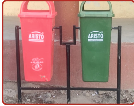
Fiber Twin Bin