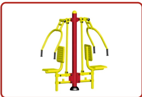
Chest Press Double