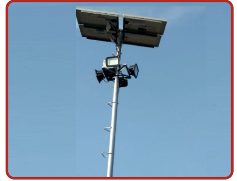
Solar High Mast