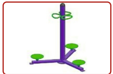
Triple Standing Twister