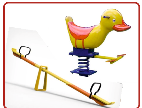
See-Saw / Duck Ride