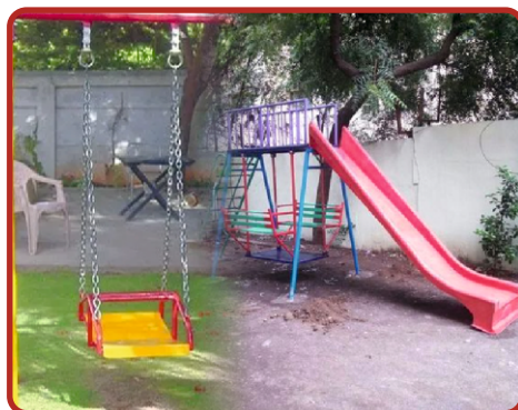
Swing / Slide