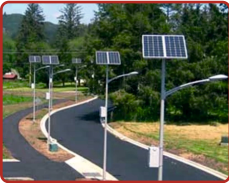
Solar Panel Street Light