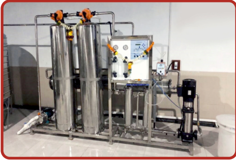
SS RO Plant