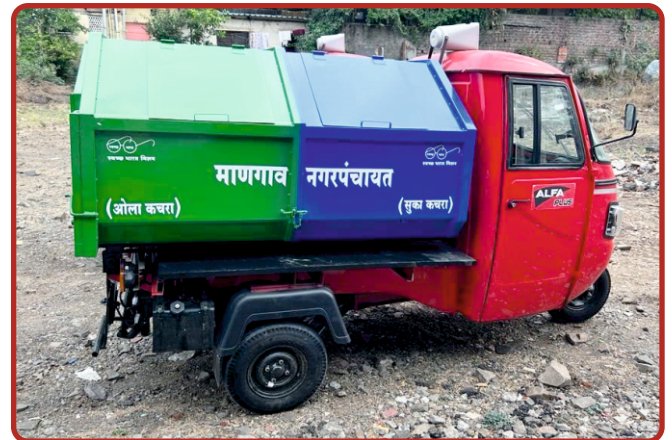
Three Wheeler Ghanta Gadi