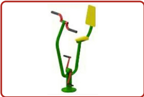
Arm & Pedal Cycle