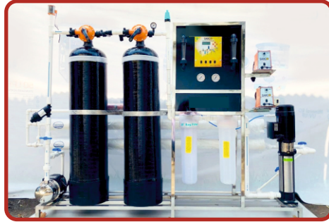
FRP RO Plant