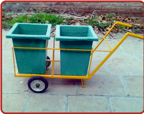
Dust Bin Trolley