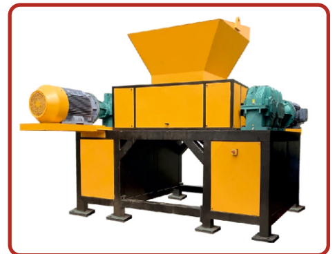
Organic Waste Shredder